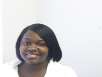
Employee of the Month