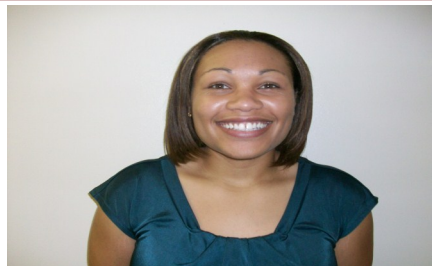
VP Choice Award